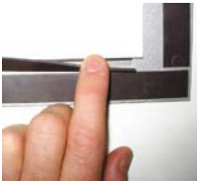
Integrated image retainer

Application: Internal, not suitable for external applications.