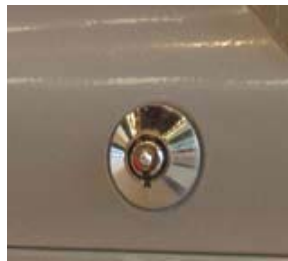
External cam lock