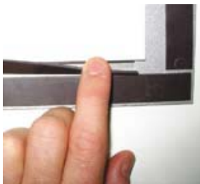
Integrated image retainer

Application: Internal only. Not suitable for exposed external applications.