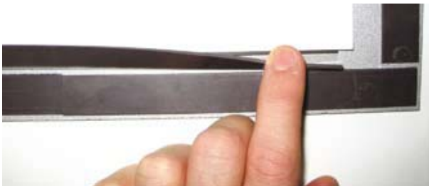
Integrated image retainer