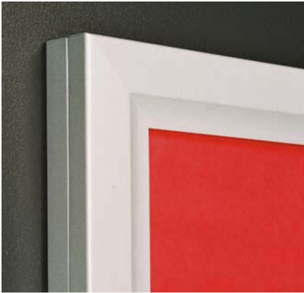
Tango Corner aspect